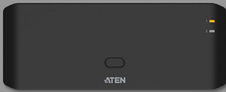
2 x 4 USB 2.0 Sharing Switch