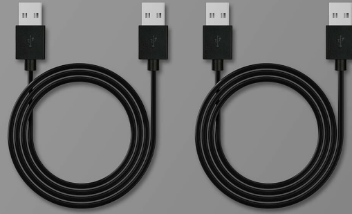
USB Type-A to Type-A cable x2 (1.5 m)