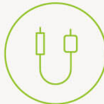
Plug and Play