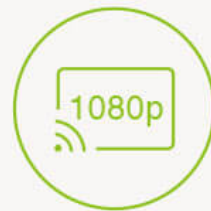
1080P Live Streaming