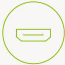
4-Port HDMI Input