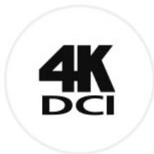
Superior Visual Quality