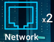
CN9850 ▲ 1-Local / Remote Shared Access Single Port 4K HDMI KVM over IP Switch