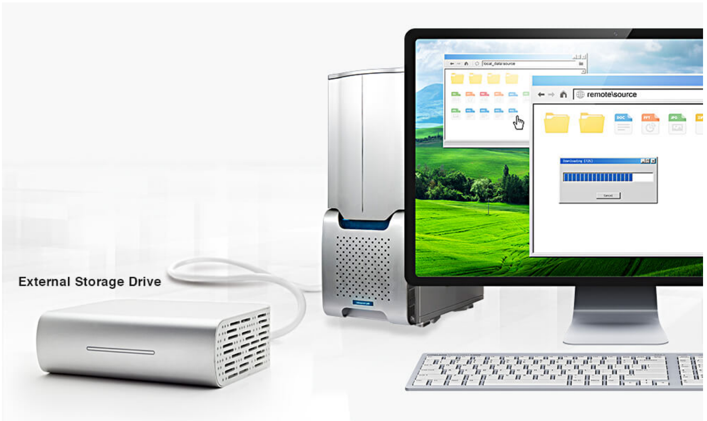
External Storage Drive