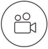
Dual Video Capture