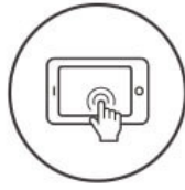
Bluetooth Wireless Control