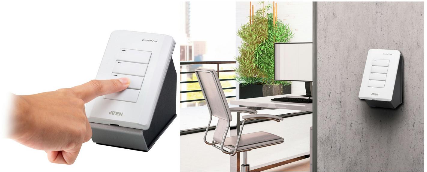
Enables flexible installation for either placement on the table or mounting on the wall