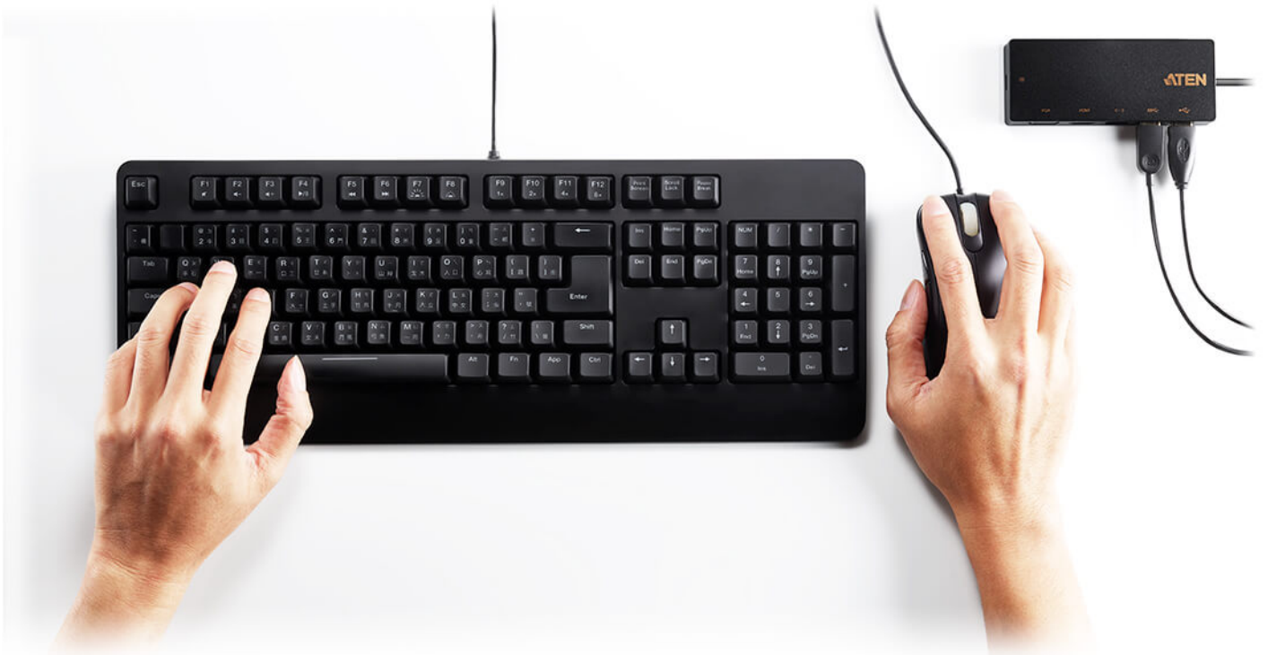
Expansion for a Mouse and Keyboard