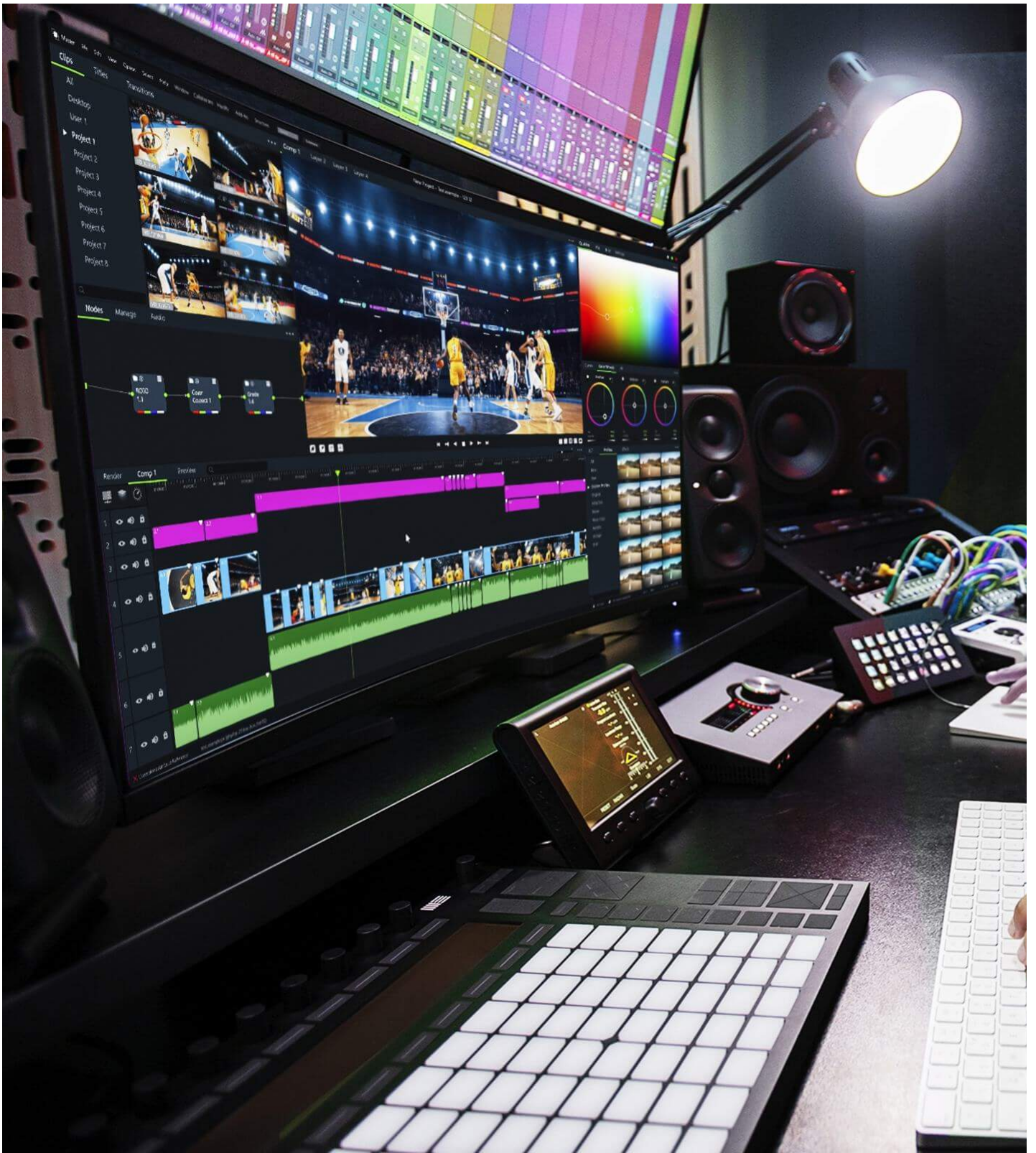
Media Post Production