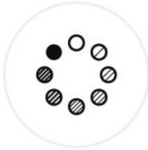
12-bit Deep Color