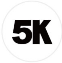
Exceptional Visual Quality