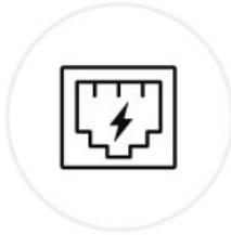
10 Gbps Network