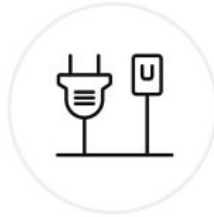
Network / Power Redundancy