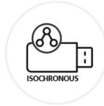
Isochronous USB Transfer